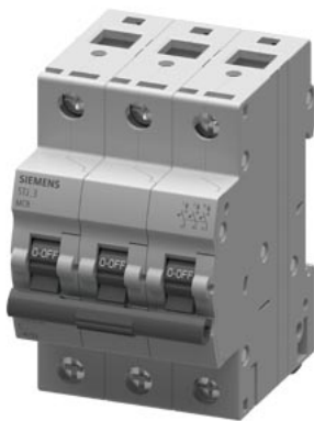
SINOVA, Miniature Circuit Breaker 415V 6kA, 3-pole C, 32 A