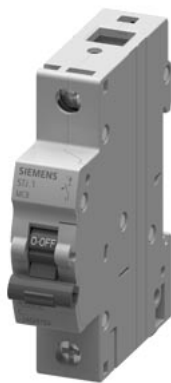
SINOVA, Miniature Circuit Breaker 240/415V 6kA, 1-pole B, 10 A